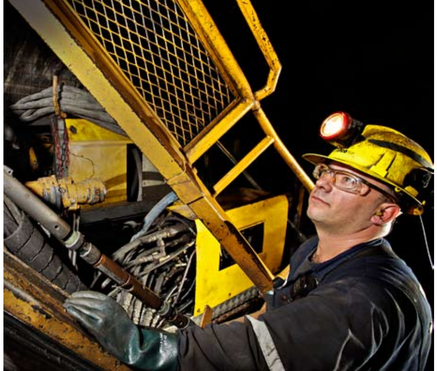
Drilling with BOTW Thin wall core barrels in underground application.

Until this point, they had been using a skid-mounted Diamec 252 core drilling rig, which had given consistently good performance. However, moving the rig to different drilling locations in a single operator environment made it an impractical proposition. In addition, Vale Inco needed a rig that would work on multiple levels in the same